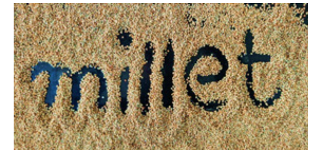
Figure 1: Pearl millet

Cereal grains are considered a potent source of energy in human diet. Due to higher temperature tolerance and low maintenance cost with dense nutrient, pearl millet attracts the cultivators as well as researchers among all the cereal grain crops. Millets are classified into two categories as major millets which includes proso millet ( Panicum miliaceum ), foxtail millet ( Setaria italica ) and pearl millet ( Pennisetum glaucum ).