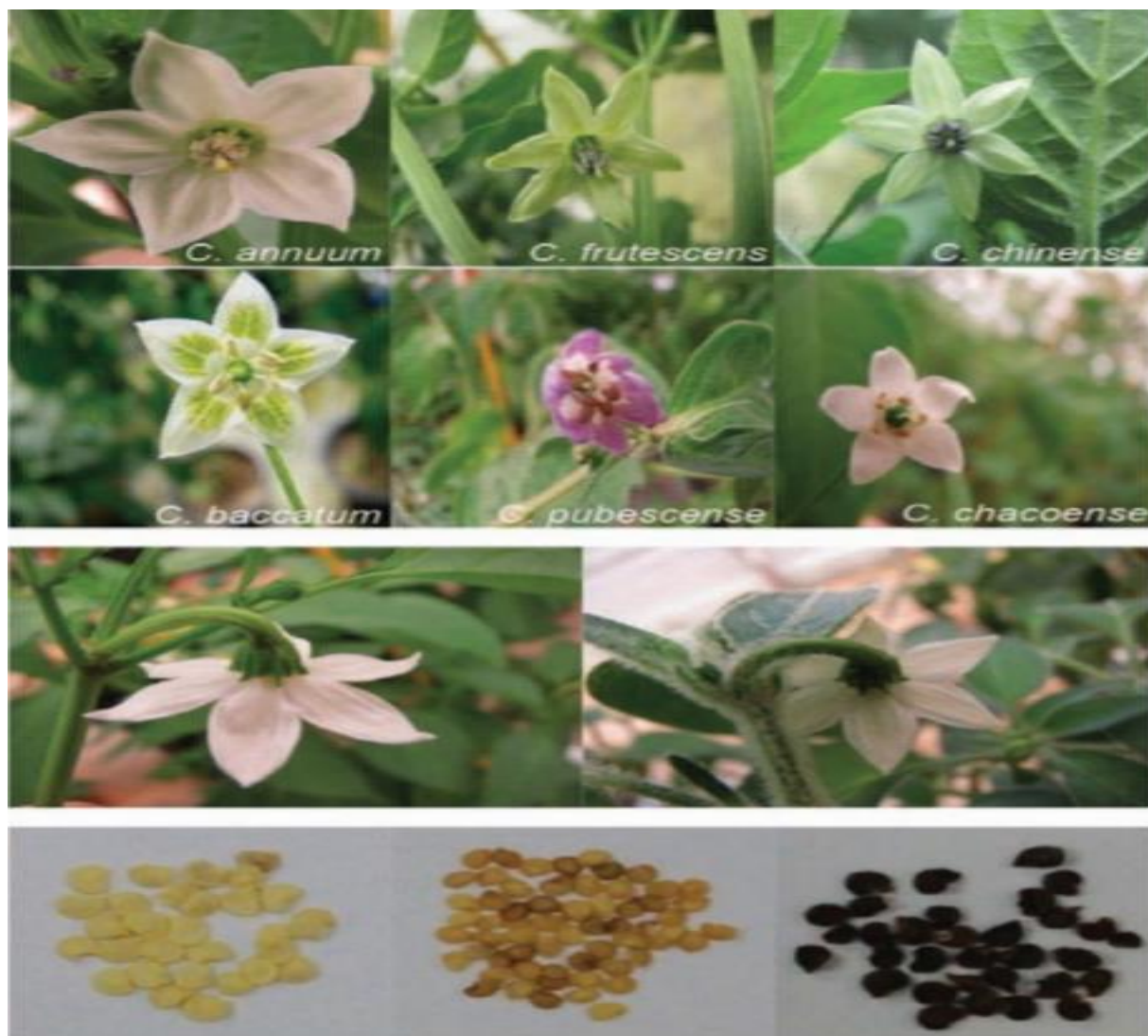
Fig 2: Wild species of chili used for resistance breeding against various biotic and abiotic stress resistant breeding programme