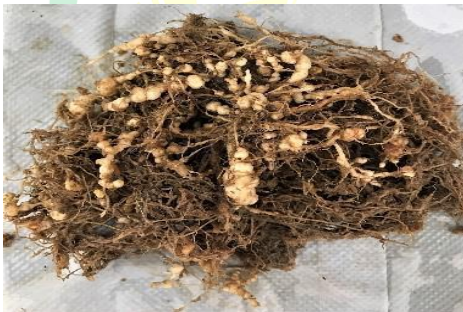
Fig. Root knot nematode of tomato crop

Vegetable gardening is a prevalent activity for many people in urban and rural area. In addition to being enjoyable, the vegetables just look to taste best when they are home grown. Inappropriately, human being is not the only individuals who eat vegetables. Most gardeners have had the knowledge of putting hours of hard work into a garden expecting a bountiful harvest only to have it lost due to some problem. They may be things we can see, such as birds, rabbits or insects along with they may be imperceptible, too small to be seen. Due to warm temperatures, sandy soil, and humidity, India has more than its fair share of microscopic pests and pathogens. Plant-parasitic nematodes can be among the most damaging and hard-to-control of these organisms.