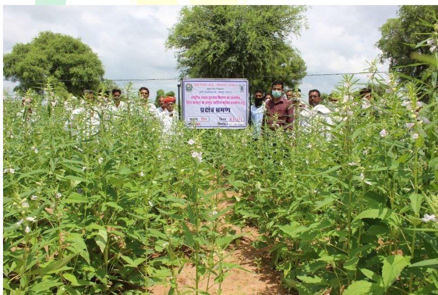
Field visit at Roon village