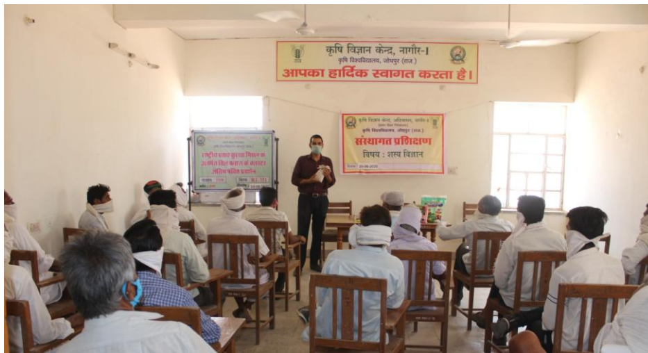
Training of Sesame farmers at KVK, Nagaur-I