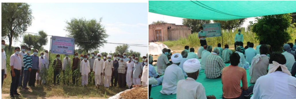
Field day at Roon village