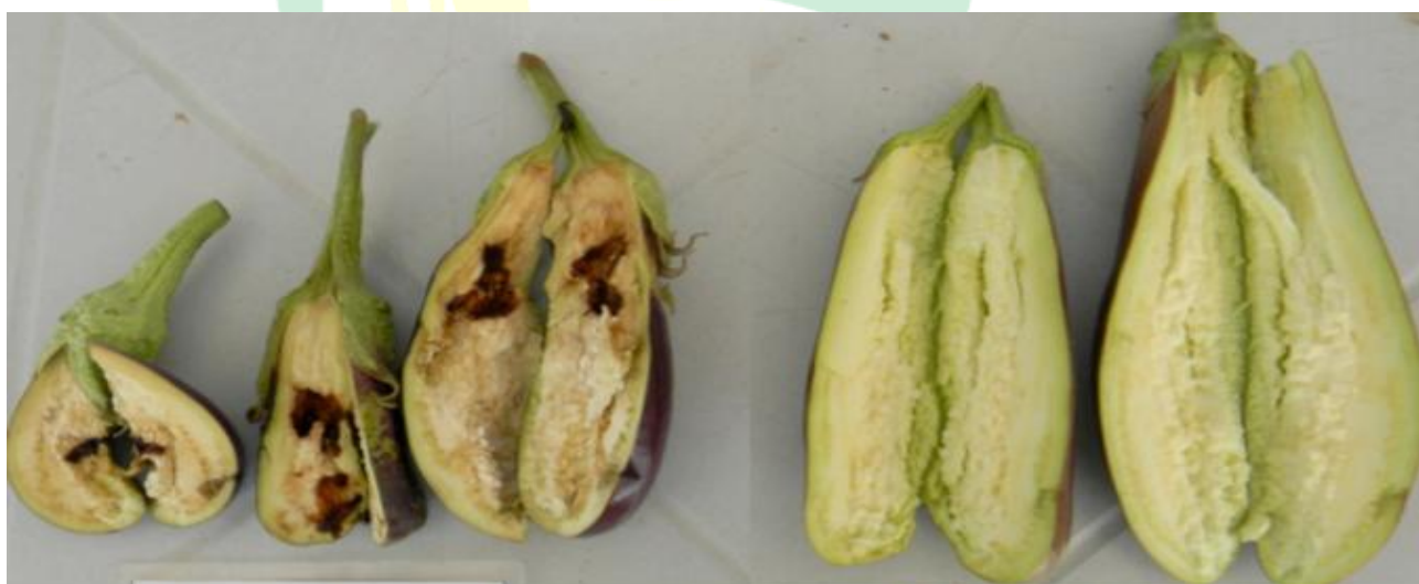
Figure 3. Non-Bt eggplant