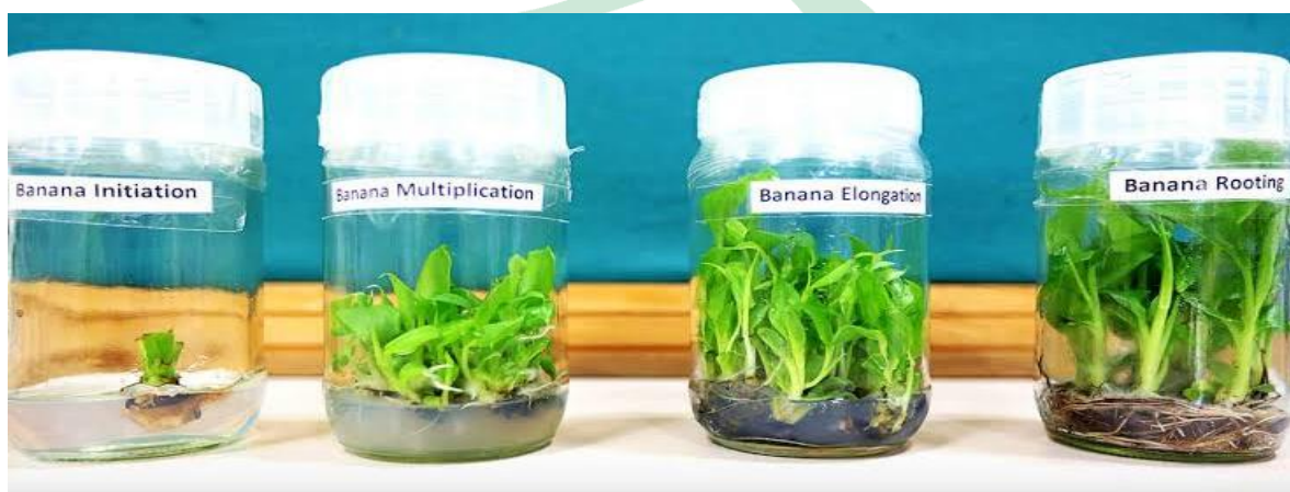
Figure: Different stages of banana tissue culture.