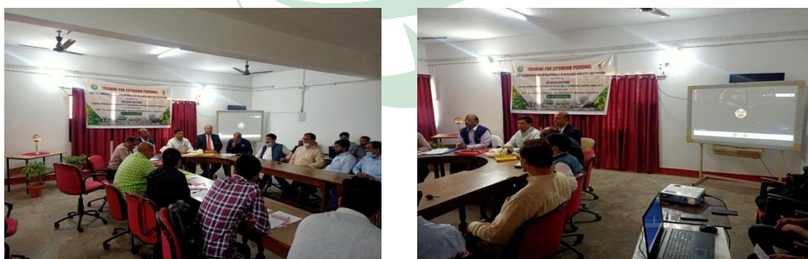
Fig.-4: A group photo of all the staff of Section of Oil Seeds at CSAUAT, Kanpur.