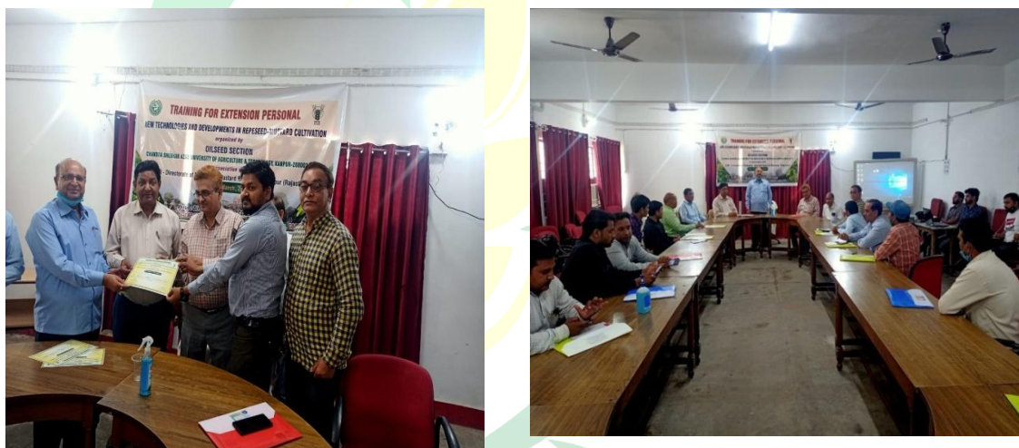
Fig.-3: Training activities during Two days trainings for Extension Personals.