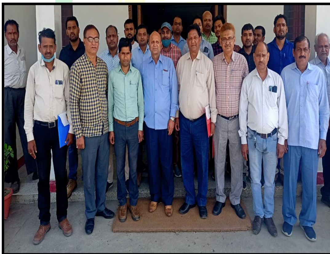
Group Photo of Training programme Co-Ordinator, other staff & Extension Personals.