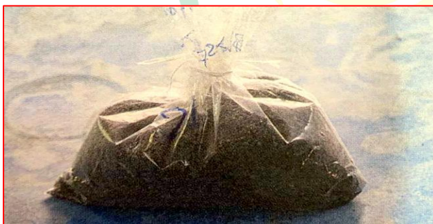
Pack the collected sample