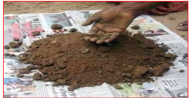
'Remove foreign materials like roots, stones,