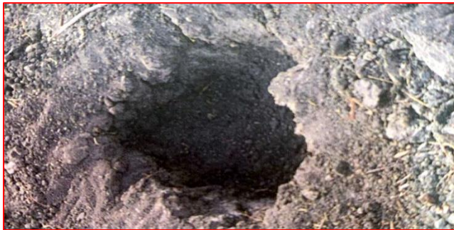
'V' shaped cut

11. Estimate the moisture content of sample before every analysis to express the results on dry weight basis.