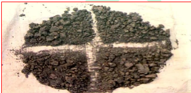
Quartering is done by dividing the thoroughly mixed sample into four equal parts