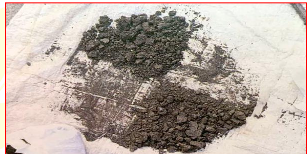
'Two opposite quarters are discarded and the remaining is mixed