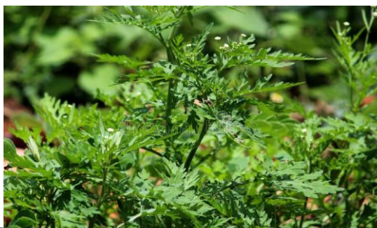
Parthenium hysterophorus L.