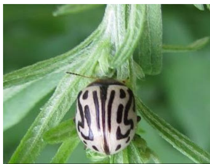
Mexican beetle [7]