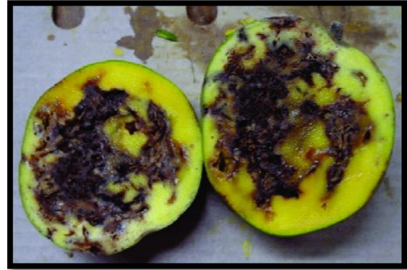
Photo 4. Damage at a later stage