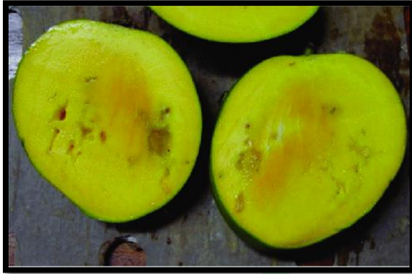
Photo 3. Initial damage