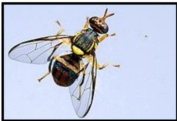
Photo 1. B. invadens male