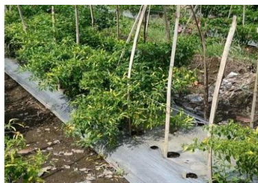
Trellis with plastic sheets