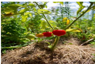
Trellis with straw mulching