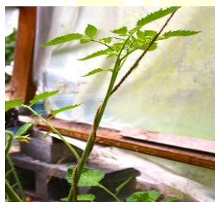
Pruning with strings