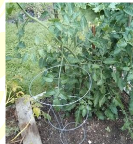
Wire tomato cage