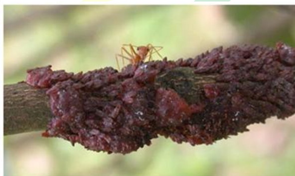
Fig.1. Twig with Lac

They have initiated several schemes and programs aimed at training and equipping tribal communities with the requisite skills and resources to enhance their lac production capacities. Such efforts have not only led to increased production and improved product quality but also facilitated the integration of traditional lac culture into modern market systems. Lac culture, the cultivation of lac insects for the production of lac resin, is a significant contributor to the economy of Bastar, Chhattisgarh. As one of India's most impoverished regions, the tribal communities of Bastar rely on traditional industries like lac cultivation to sustain themselves. This article aims to examine the role of lac culture in the tribal economy of Bastar, Chhattisgarh, the challenges faced by the community, and the potential for growth in this sector.