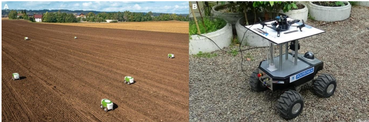
Fig. (A) Mobile agriculture robot swarms for seeding purpose.