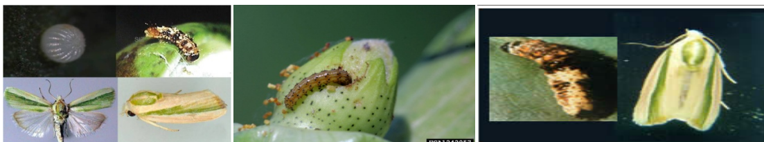
Spotted or spiny bollworms – ( Earias vitella Fab.)