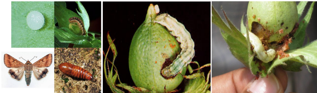
American bollworms ( Helicoverpa armigera H.)