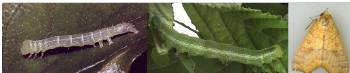
Cotton semi looper ( Anomis flava )