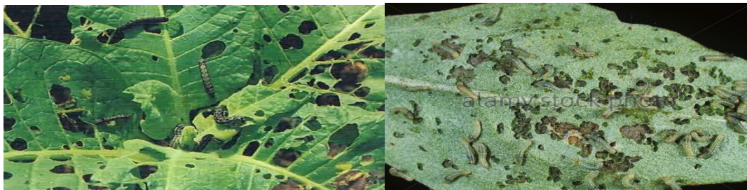
Tobacco Leaf eating caterpillar ( Spodoptera litura )