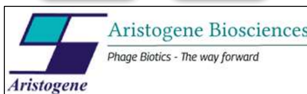
Figure 2: Bacteriophage based feed supplements available in India