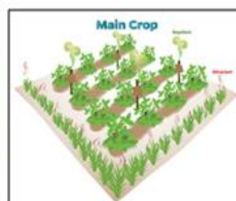
Fig 3. Push-pull