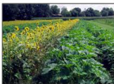
Fig 2. Chocolate box ecology