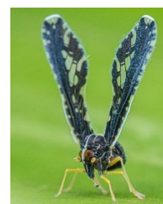
Stephanitis typica Proutistamoesta