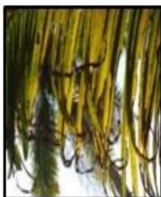
Flaccidity of leaflets