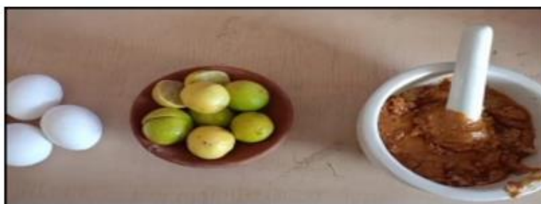
Fig 1.1 - Ingredients – Egg, Lemon, Jaggery

ITK is used for different purposes like flowering enhancement; Pest and disease management; Soil fertility enhancer, Seed and seedling treatment etc. Many farmers use ITKs to maintain a friendly environment without causing any damage to the environment. Also improves the crop yield. The population of India is growing rapidly and the demand for food is also increasing. ITK is the total knowledge and practices which are based on people's experience in dealing the situations and problems in various aspects of life. These ITKs can play a significant role in the overall socio-economic development of the communities.