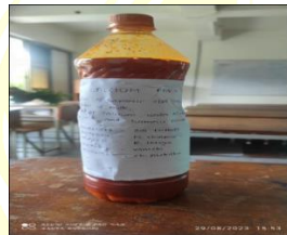
Fig:1.5 Calcium arkh