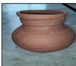
Fig:1.1 Earthen pot

Calcium Arkh which provides calcium to plants is essential for their growth and development. Calcium helps in promoting root growth and improves nutrition uptake. It also helps by preventing disease and disorders in plants.