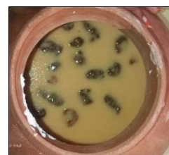
Fig: 1.4 Day 1-3