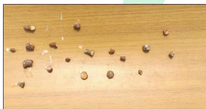
Fig: 1.5 Dried turmeric clots