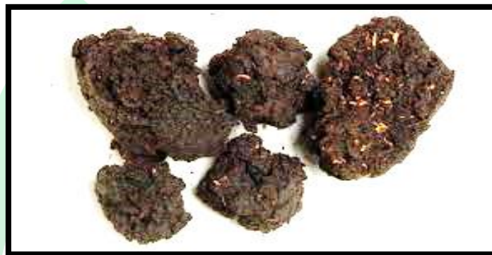
Figure 3: Sugarcane press mud

Sugar press mud, sugarcane filter cake mud, sugarcane filter cake, or sugarcane filter mud are all names for press mud. It is the byproduct of sugarcane juice filtering. In general, a plant generates 10 ton of sugar and 1 ton of sugar press mud. The sugarcane business emits a large quantity of press mud, which pollutes the environment. Sugarcane press mud is an excellent material for composting and producing organic fertilizer.