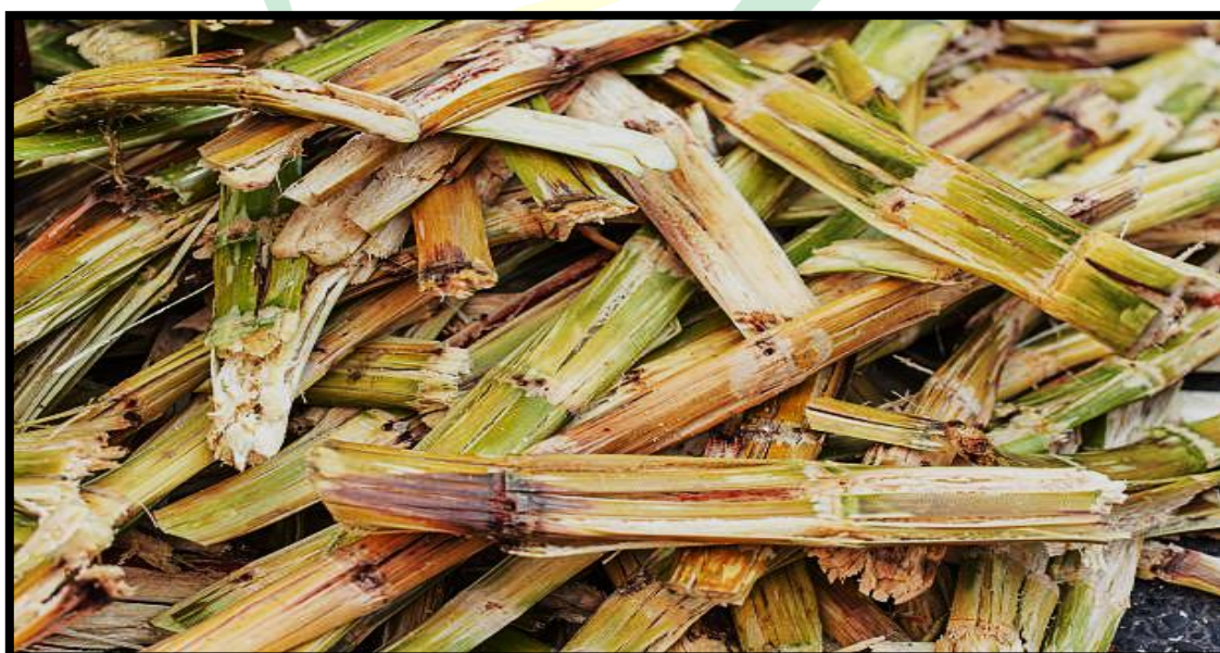
figure 2: Sugarcane bagasse