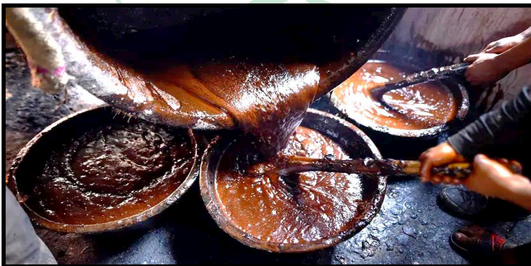
figure 4: Molasses

Molasses is also called treacle syrup which is obtained by sugar crystallization from sugarcane. It is discarded as a byproduct of the factory. It will cause major water contamination if released directly without treatment due to its vast volume, high acidity, and complicated makeup.