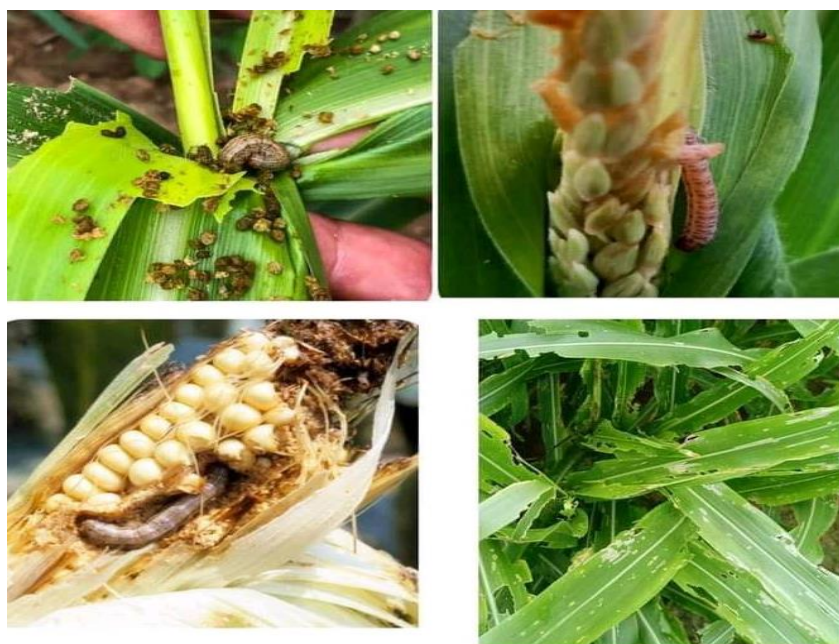
Fig 1: Damage symptoms of Spodoptera frugiperda