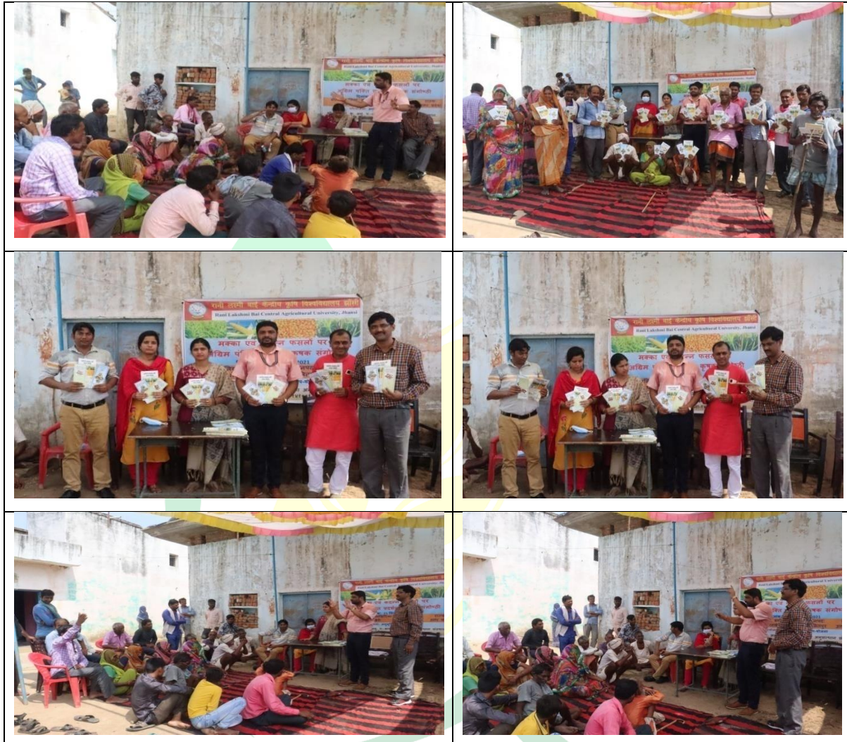
Table-14: Organized Kisan Gosthi On 25 th September, 2021 Under FLD on Millets at Emiliya Village Of District Lalitpur.