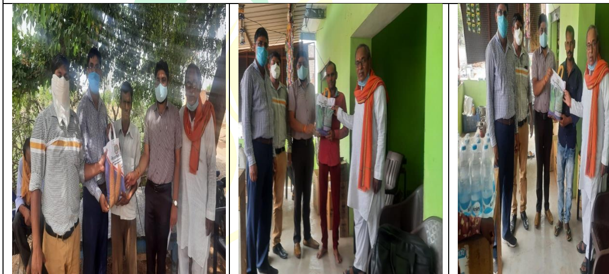
Fig.-5: Hybrid maize seed distribution at Village Nayakhera District Jhansi under FLDs on maize during kharif -2021.