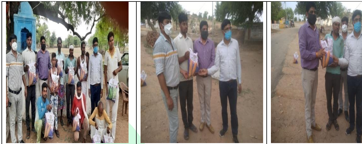
Fig.-4: Hybrid maize seed distribution at Sanora Village District Datia under FLDs on maize during kharif -2021.