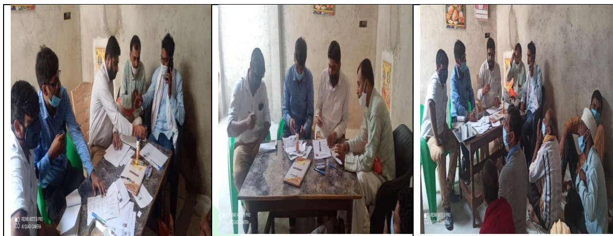
Selection of the farmers under FLDs on maize during kharif -2021 in Lalitpur District.