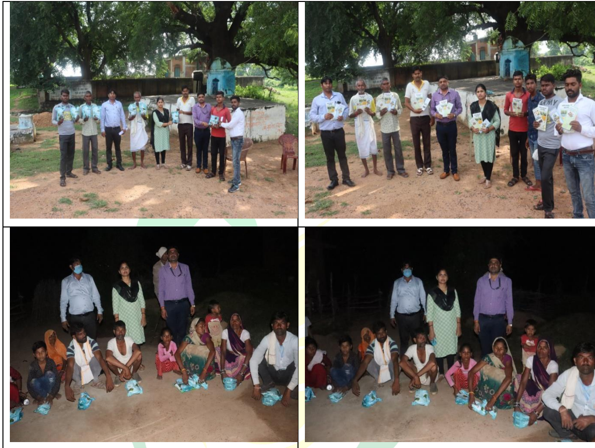
Table-18: Fertilizer Distribution Under FLDs on Maize in Nayakhera Village District Jhansi.