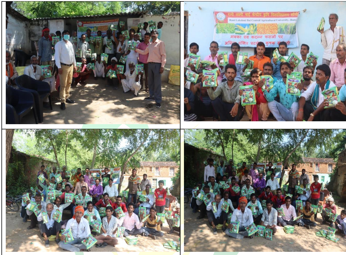
Table-20: Performance of FLDs on Maize Under Scsp Programme in Nayakhera Village of District Jhansi.