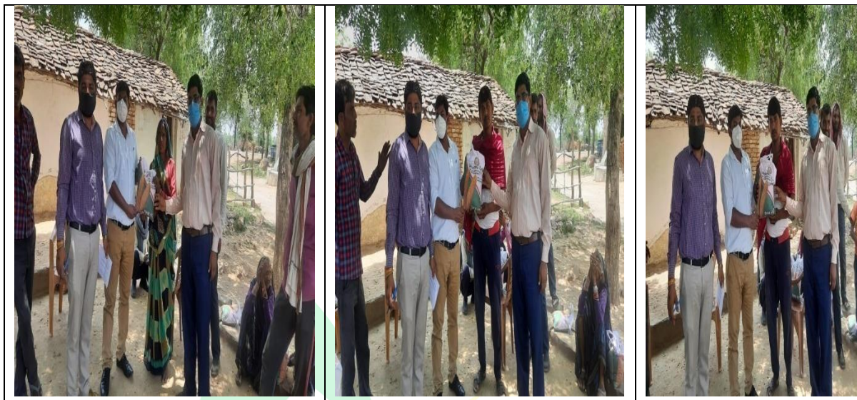
Fig-6: Hybrid seed distribution at Village PUNCHAMPURA District Tikamgarh under FLDs on maize during kharif -2021.