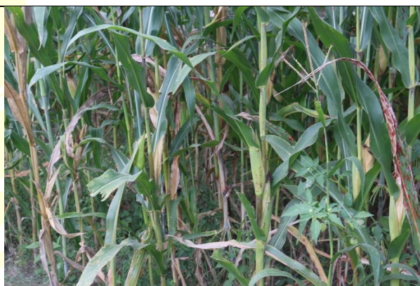
Table-22: Performance of FLDs on Maize Under Scsp Programme in Emiliya, Barkhiriya, Dhovankheri and Bastravan Villages of District Lalitpur.