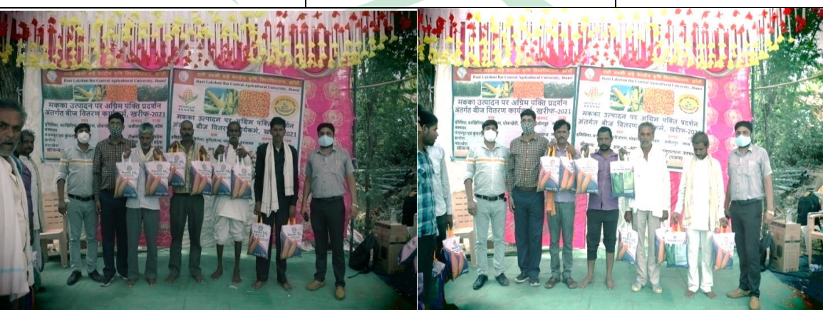
Fig-7: Hybrid seed distribution at Karitoran, Emiliya, Barkhiriya, Dhovankheri & Bastravan village of Lalitpur District under FLDs on maize during kharif -2021.