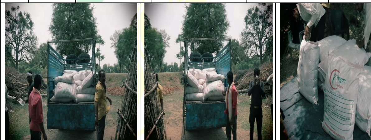
Fig.-3: Hybrid maize seeds loading and transfer at Farmers field for distribution under FLDs on maize during kharif -2021.