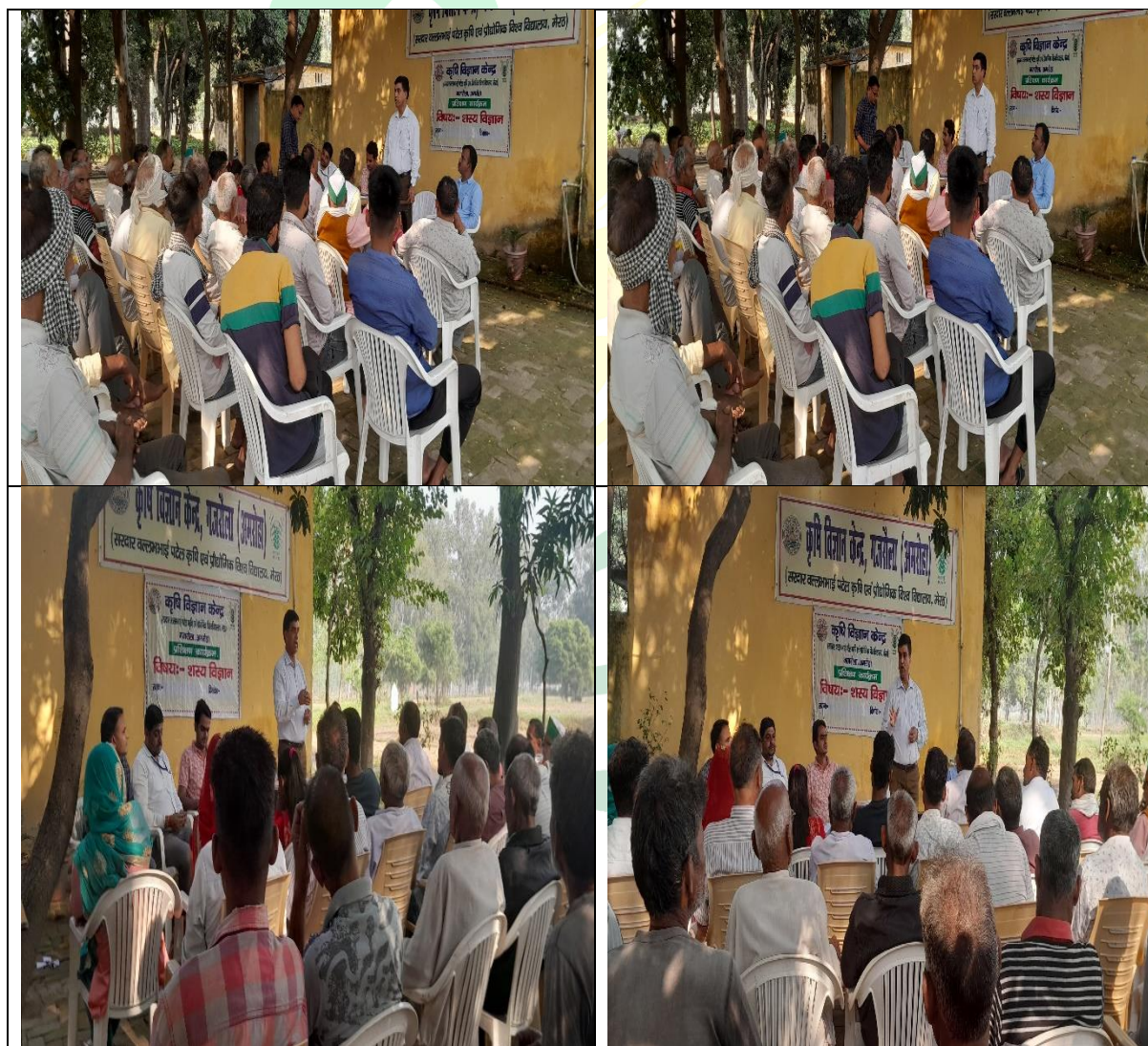
Table-5: Conducted Training on Mustard varieties & production technology and seed distribution programme under CFLDs on Mustard during Rabi, 2022-23.