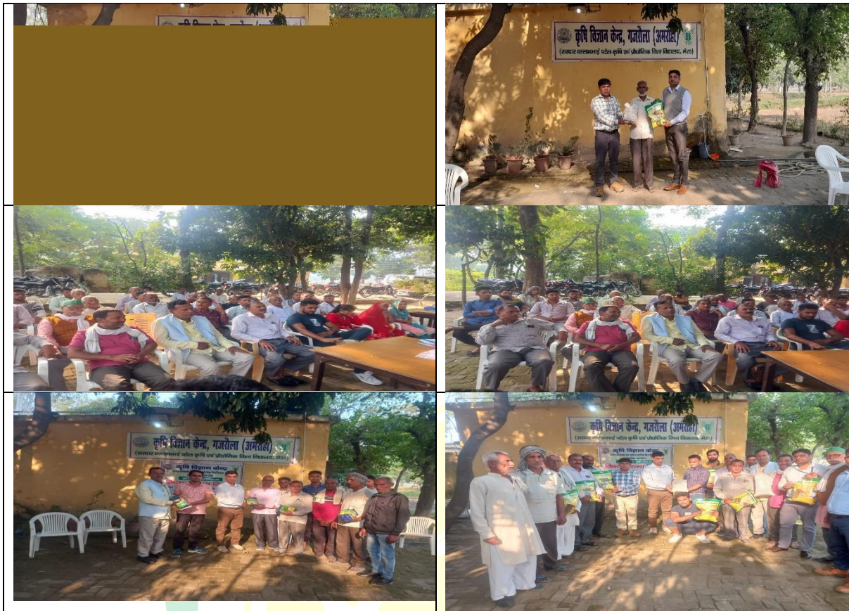
Organized Field Day Under CFLD on Mkustard Field visit & monitoring the performance of CFLD on Mustard at village Khajuri & Dhanori on 11/01/2023.