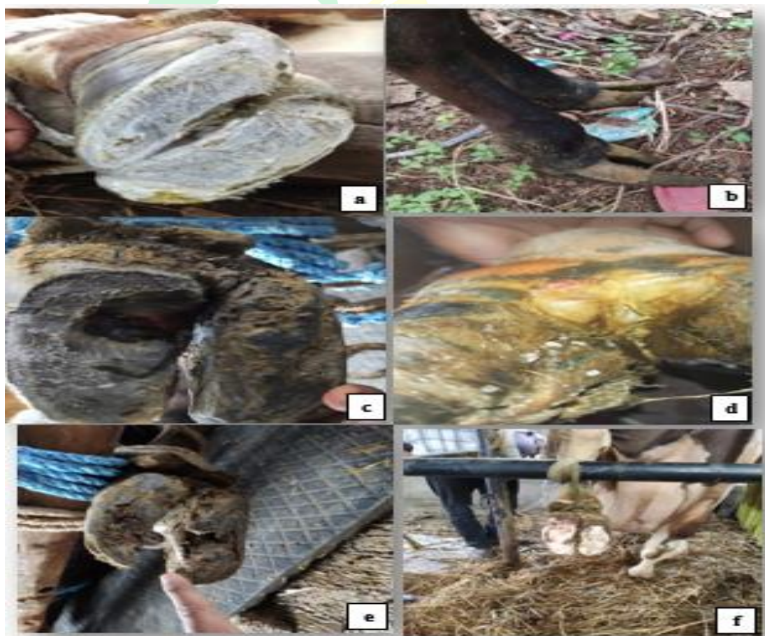
Plate 1 Animals showing different hoof lesions, White line disease (a), Overgrown hoof (b), Sole ulcer (c), digital dermatitis (d), Double hoof (e), Sole hemorrhage (f).

With advancement in age the incidence of lameness increases and follows an inverted 'U' shaped relationship with age. Higher risk of lameness was observed during 7-8 years (Dembele et al. , 2006).