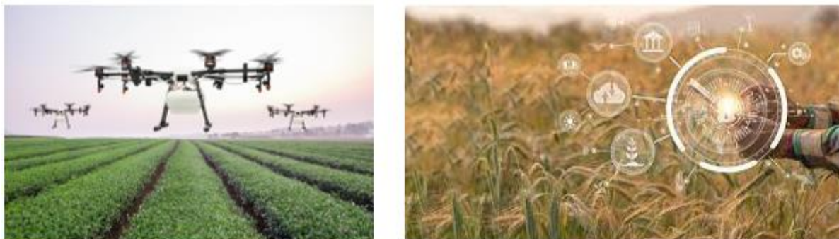
Figure 2: Customization and Personalization in Agriculture

The use of cutting-edge technologies like drones, satellite imagery, and sensors further enhances precision farming and resource management. Drones equipped with cameras provide high-resolution images of farmlands, enabling farmers to monitor crop health, detect early signs of diseases, and optimize irrigation practices. Satellite data assists in assessing soil conditions and predicting crop yields, while sensors in the field collect real-time data for more efficient decision-making.