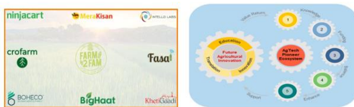
Figure4: Different Agri-startups and Agricultural Innovation Model

Private extension services often adopt entrepreneurial models, creating a self-sustaining ecosystem. Agri-entrepreneurs and startups are actively engaging in extension activities, offering not only advisory services but also facilitating access to inputs, credit, and markets. This holistic approach contributes to the economic empowerment of farmers and strengthens the agricultural value chain.