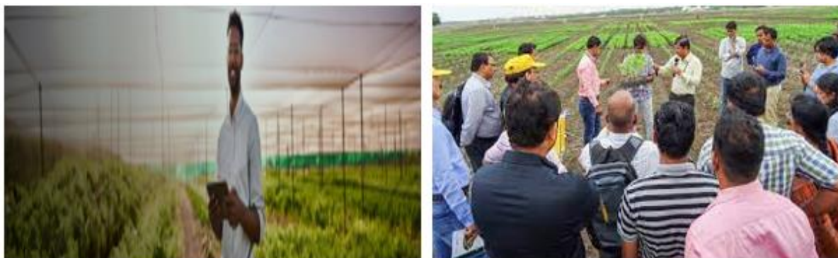
Figure 6: Capacity Building and Training of Farmers in Private Extension Services