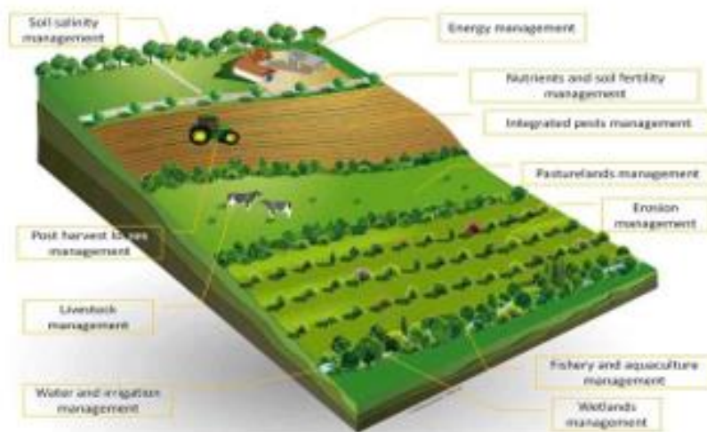
Figure5: Model of Sustainable Farming

footprint of agriculture and building resilience against climate change impacts. This forward-looking approach reflects a commitment to ensuring the longevity and viability of farming practices.