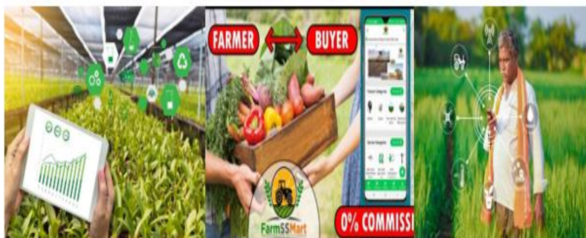
Figure 1: Integration of technology in private extension services

One of the standout trends in private extension services is the seamless integration of technology into their operations. Digital platforms, mobile applications, and data analytics are at the forefront of providing timely and customized information to farmers. The accessibility of weather forecasts, market prices, and best agricultural practices at farmers' fingertips facilitates informed decision-making, empowering them to make strategic choices for their crops. The use of cutting-edge technologies like drones, satellite imagery, and sensors further enhances precision farming and resource management. Drones equipped with cameras provide high-resolution images of farmlands, enabling farmers to monitor crop health, detect early signs of diseases, and optimize irrigation practices. Satellite data assists in assessing soil conditions and predicting crop yields, while sensors in the field collect real-time data for more efficient decision-making.