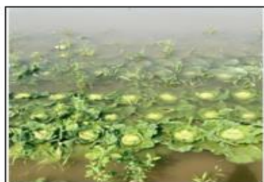
Fig. 3 Cauliflower field in excessive rainfall conditions