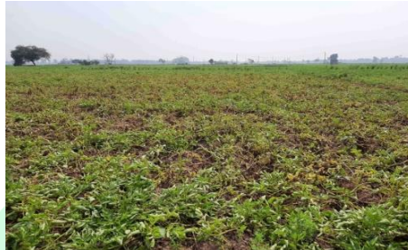
Fig .6 A severely late blight infected Potato field.

Crop Failures and Shortages: Natural disasters, pest infestations, or diseases can lead to crop failures, reducing the overall supply of vegetables. If demand remains constant or increases, shortages can result in higher prices (Fig.6).