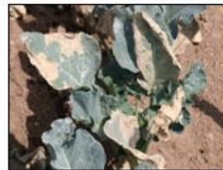
Fig.5 High-temperature affected cabbage field