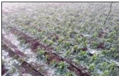
Fig. 4 Hailstorm affected tomato field