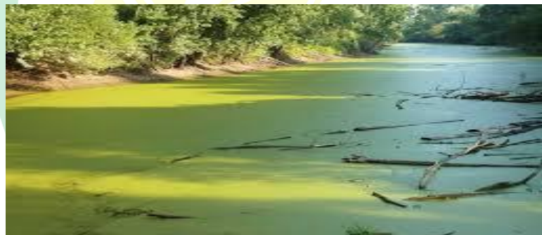
Fig. 3. Algal bloom in surface water