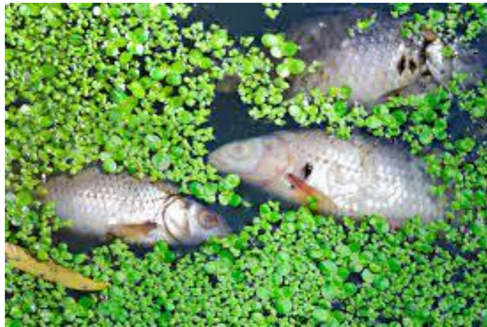
Fig. 2. Fish dying into water body due to high algal bloom