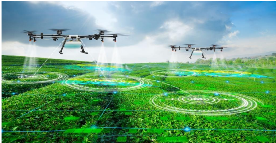
Figure 2: Drone technology in agriculture