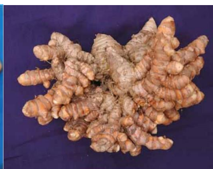
IISR Alleppey supreme