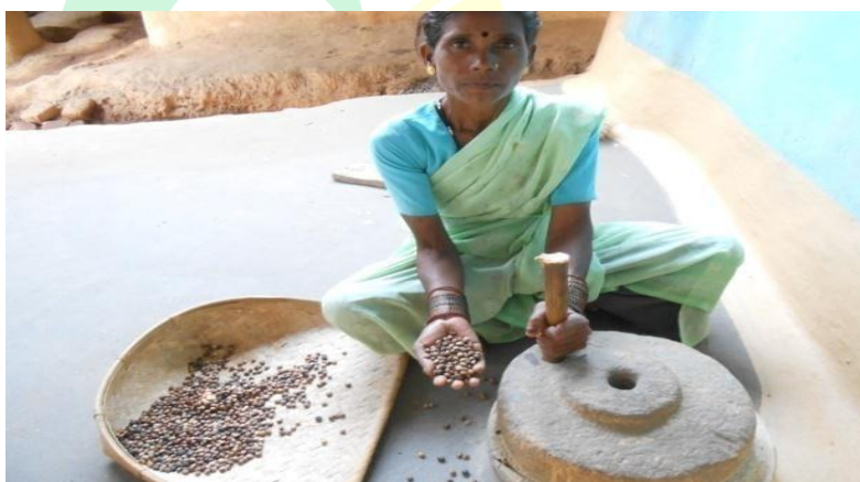
Fig:1 Indigenous technique of chironji decortications (Singh et al. , 2016)

than the kernel and the collector generally grind the seed to extract the kernel, 5kg of fruit can yield nearly 1 kg of chironji. A single tree can yield 3-4kg of chironji. The presence of hard seed coat is one of the major challenges in the decortication of the nuts. The small size of the seed causes damage and spoilage during decortication process which lowers the seed's economic worth and reduces its shelf life and results in poor storage stability. Chironji decortication is a labour-intensive, and time-consuming process when it is done through traditional methods. Around 20% of the kernels is recovered from the whole and the remaining is either cracked or mashed. The processing method that was used is primitive which results in huge losses. These losses are not only in terms of financial loss but also in terms of nutritional loss. In addition to this, the processing cost rises because the method requires an extensive amount of work (Singh et al. , 2016).