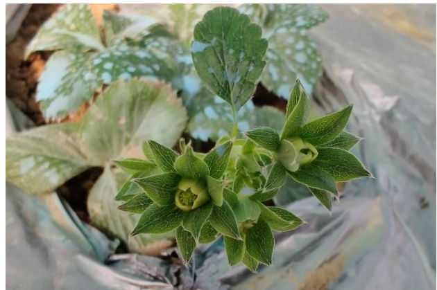
Fig.4.Bearing Habit of Strawberry (Crown Bearing)

Seasonality: Strawberry plants typically produce flowers in the spring, with the timing varying depending on the specific cultivar, climate, and growing conditions.