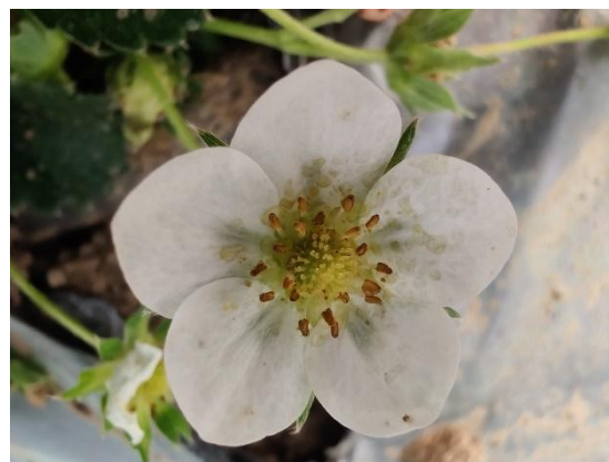
Fig.7. Stigma receptivity of Strawberry

For stigma receptivity through visual method, stigmas of different age groups i.e. two days and one day before anthesis, on the day of anthesis and one and two days after anthesis were observed with the help of hand lens. The stigma receptivity increased with the age of the flower bud up to the day of anthesis and after that it declined gradually. Mean stigma receptivity two day prior to anthesis was 1.16 per cent which increased to