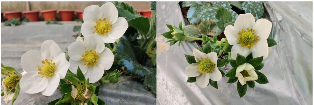
Fig.2&3. Inflorescence type & characteristics of strawberry flower

Clustered Arrangement: Strawberry flowers are clustered together, with multiple flowers appearing in close proximity to each other. These flowers are attached to the receptacle, which is the thickened part of the stem to which the flowers are attached.