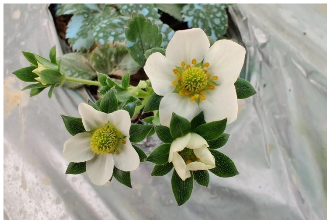
Fig.5. Anthesis of Strawberry

The process of opening of flowers in strawberry took place rather quickly. The calyx segments were noted to separate out gradually due to the inner pressure of the protruding corolla. On the day of anthesis, the buds became balloon shaped and petals appeared slightly loose. First of all, a small split in the center of the upper portion of corolla was noticed. The splits slowly appeared as adjacent petals were pushed out and it divided